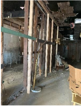
The dividing wall between two retail spaces is being removed to provide more than 1,500 square feet of retail space on the first floor.