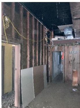
Temporary supports were designed and installed until new engineered posts and beams are placed.

Worthy Ambition LLC was hired as the General Contractor in a collaborative Construction Management role to help the customer overcome the obstacles encountered over the previous year trying to launch this project. Awarded the work in June 2023, our Worthy Builders team has already made significant progress in the demolition, planning, and managing of the re-design and reconstruction during the "structural phase" of this 3000 SF renovation.