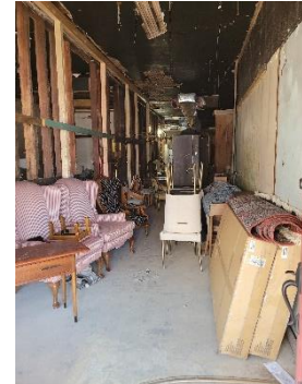
Valuable and fragile items had to be carefully moved for demolition to begin.

Worthy Ambition LLC was hired as the General Contractor in a collaborative Construction Management role to help the customer overcome the obstacles encountered over the previous year trying to launch this project. Awarded the work in June 2023, our Worthy Builders team has already made significant progress in the demolition, planning, and managing of the re-design and reconstruction during the "structural phase" of this 3000 SF renovation.